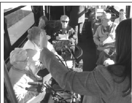
Riding the bus is safe and easy