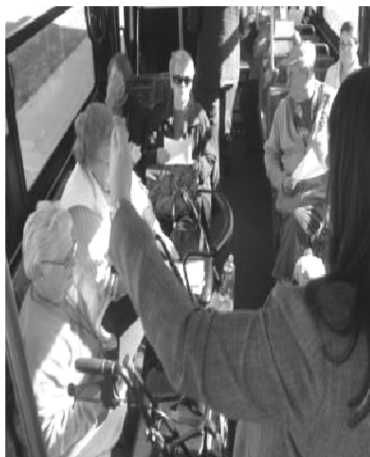
Viajar en el autobús es seguro y fácil